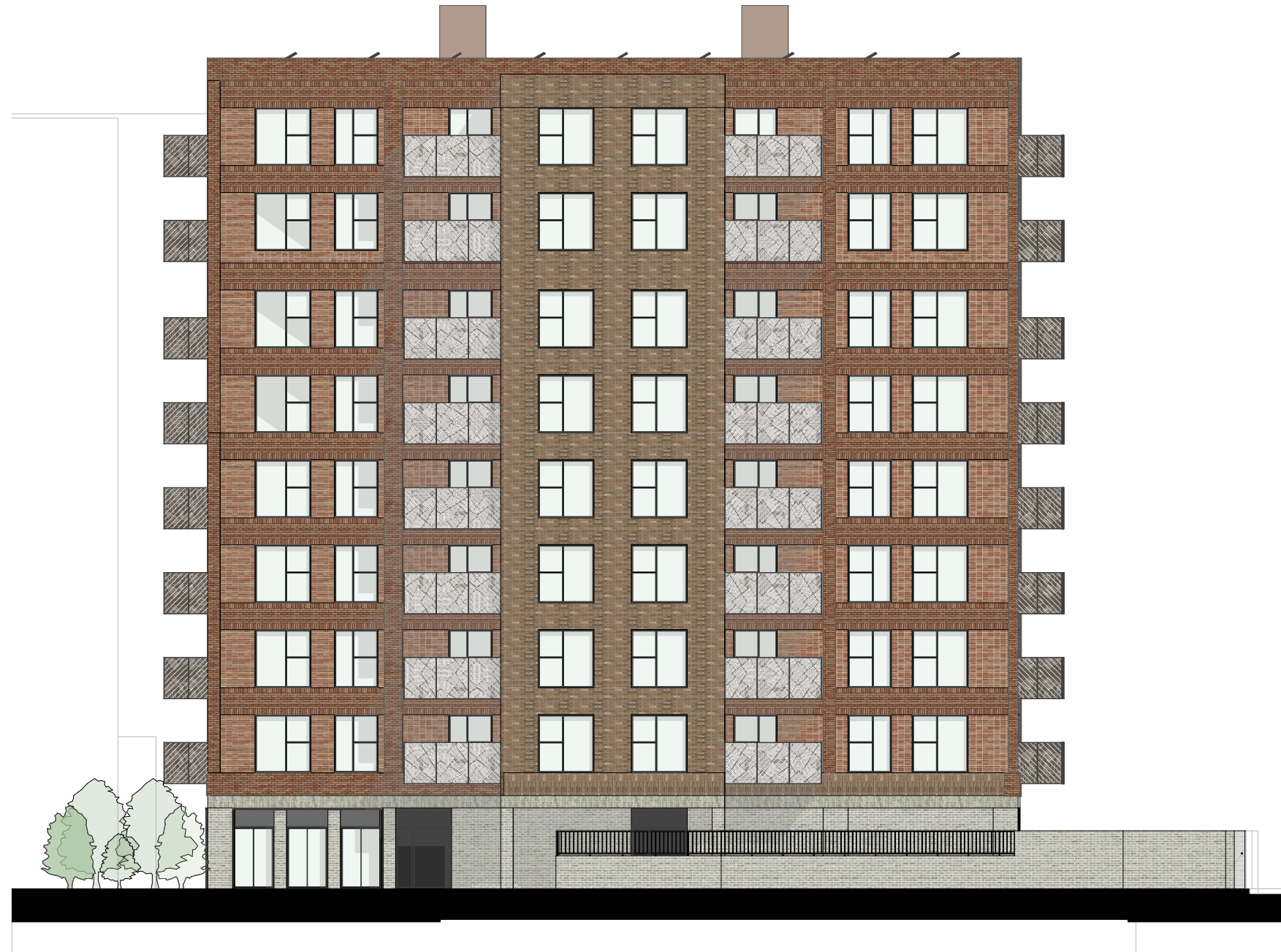
E04 Proposed East Elevation